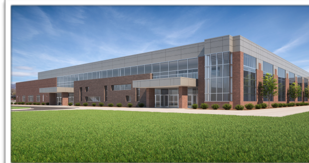
Rendering of the new athletic wing, with two gyms scheduled for completion fall, 2019