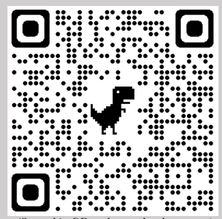
(Scan this QR code to take the survey.)

When is the right time to start listening to "holiday" music and watching "holiday" movies?